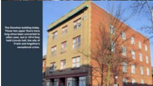
31) Donohoe Building —Photo by author, 2022