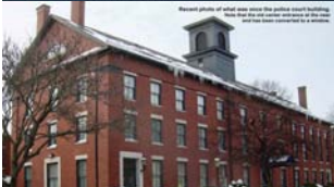
30) Former Court Building —Photo by author, 2015