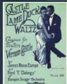
25) Castles Lane Duck Waltz