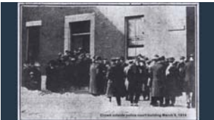
21) Crowd outside Court