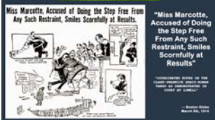
29) Boston Globe Cartoon —From Boston Globe , March 5, 1914.