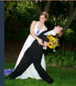
28) Silly Wedding Dip —Family wedding photo by AVR Photography, 2008.